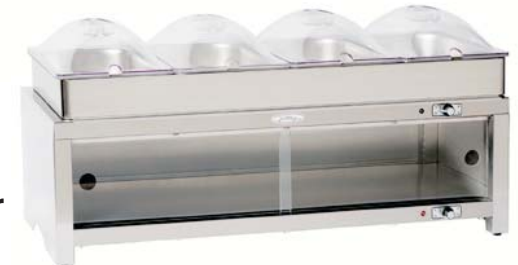
Model MLB-CSLP4 Warming Cabinet with Family Size Buffet Server