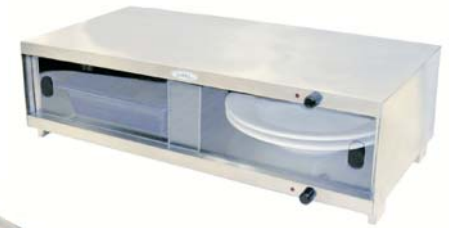
Model MLW-C Warming Cabinet with Family Size Warming Tray (plates not included)