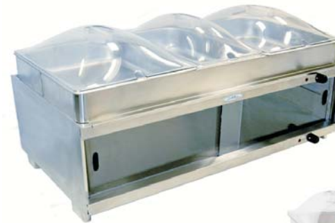
Model MLB-CSLP Warming Cabinet with Family Size Buffet Server