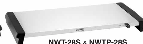
NWT-28S & NWTP-28S