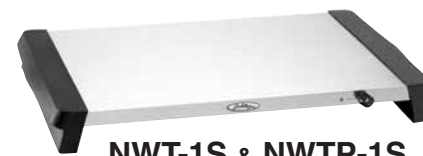
NWT-1S & NWTP-1S