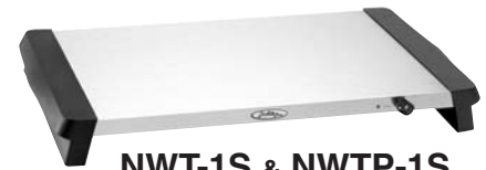
NWT-1S & NWTP-1S