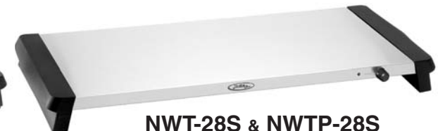
NWT-28S & NWTP-28S