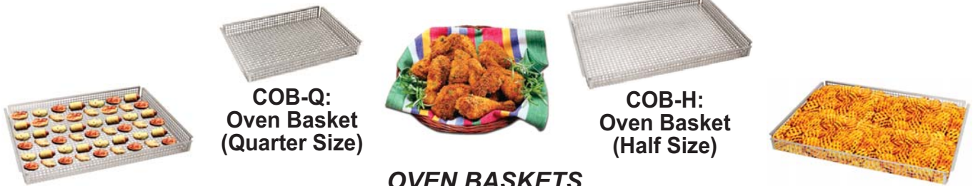
COB-Q: Oven Basket (Quarter Size)

For BroilKing Professional Quarter Size and Half Size Convection Ovens